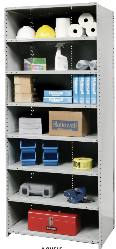
8 SHELF CLOSED STARTER UNIT