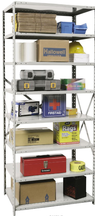
8 SHELF OPEN STARTER UNIT

+ ANTIMICROBIAL PROTECTION FOR OVER 20 YEARS!