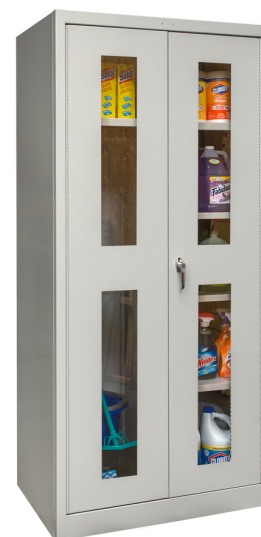
STATIONARY COMBINATION SAFETY-VIEW DOORS