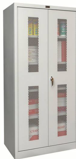
VENTILATED DOOR CABINET