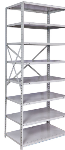
8 SHELF OPEN ADDER UNIT

Starter units include two beaded front posts, two angle back posts, one pair back sway braces, two pair side sway braces and 8-11 shelves. Adder units include one beaded front post, two angle back posts, one pair back sway braces, one pair side sway braces and 8-11 shelves.