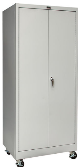
MOBILE STORAGE SOLID DOORS