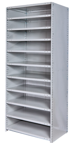
11 SHELF CLOSED STARTER UNIT