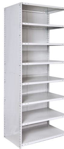
8 SHELF CLOSED ADDER UNIT

Starter units include two beaded front posts, two angle back posts, one back panel assembly, two side panel assemblies and 8-11 shelves. Adder units include one beaded front post, two angle back posts, one back panel assembly, one side panel assembly and 8-11 shelves.