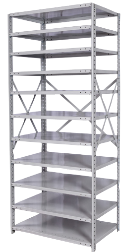
11 SHELF OPEN STARTER UNIT