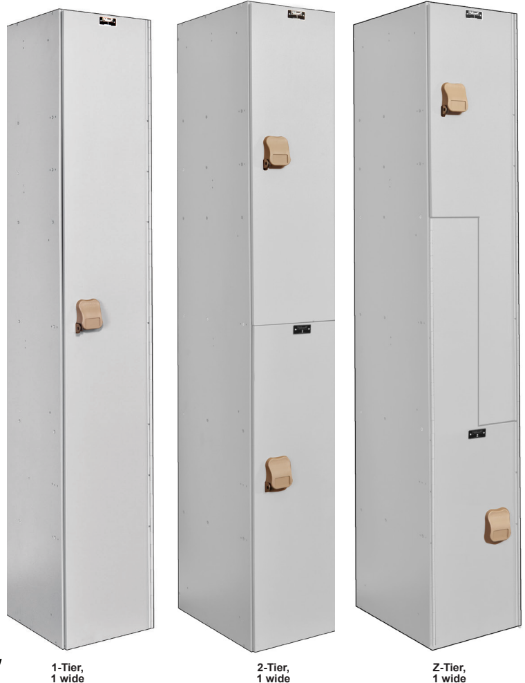
1-Tier, 1 wide

HOOKS: 2 single-prong hooks in single and double tier lockers