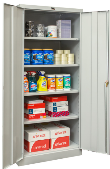
STATIONARY WARDROBE SOLID DOORS