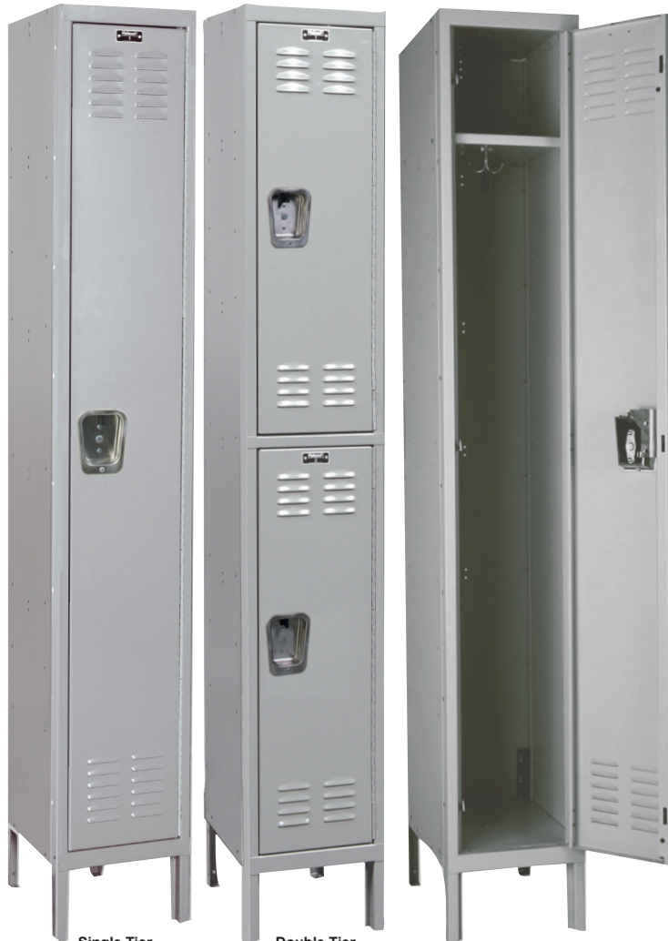
Single Tier, 1 wide, 1 opening

Specially formulated MedSafe Antimicrobial powder coating finish protects against bacteria, microbes & mildew for up to 20 years! It is ideal for a variety of settings such as healthcare facilities, athletic facilities, schools, day care centers, senior care communities, residential housing, hospitality settings and cruise ships.